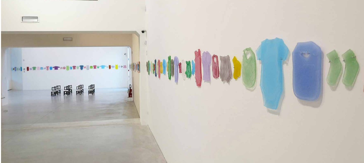
Missing Identity, 2015/2018